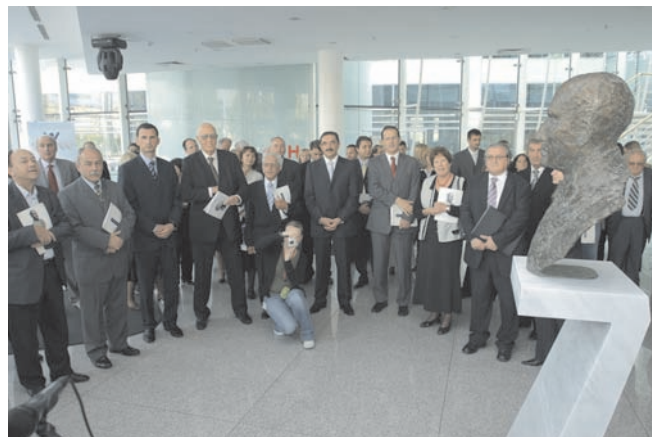
Slika 5 – Popsrje je otkriveno