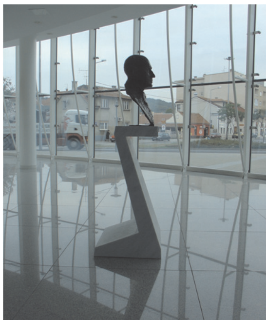
Slika 3 – Poprsje prof. Vladimira Preloga u predvorju PLIVINA Istraživačkog instituta