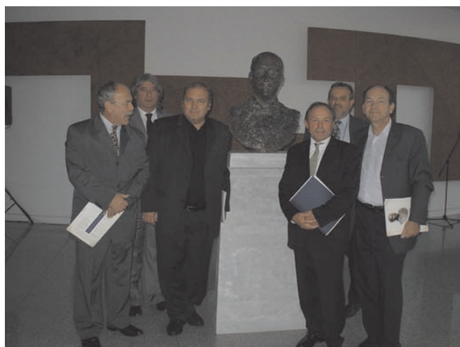
Slika 6 – Autori i domaćin s Prelogovim nećacima